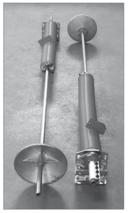
If you have any questions about this Product Info, please contact the TOORS company.